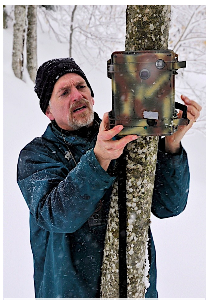
Setting up a critter cam in Jackson Valley

One such ecological keystone is Jackson Valley, a privately owned forest parcel in Jay, Vermont abutting the Canadian border. Its 936 acres encompass spruce fir uplands and a north-facing lowland bowl cloaked with Northern hardwoods. In 2008, Jackson Valley was identified by Two Countries One Forest (www.2C1Forest.org), an international alliance of fifty U.S. and Canadian conservation organizations, as an essential "missing link" the 1,158-square miles cross-boundary wildlife corridor connecting Vermont's Green Mountains with Quebec's Sutton Range.